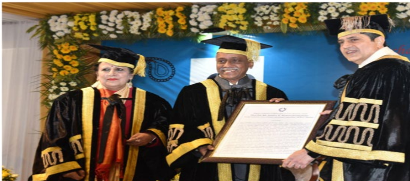
Himachal Pradesh National Law University, Shimla, organised the First Convocation 2022 on 19 November 2022, Saturday at the Adventure Resorts, New Kufri, Shimla.