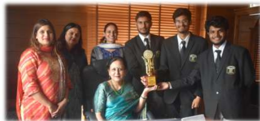
Best Memorial Award to the team of HPNLU, Shimla at National Moot Court Competition organised by Manipal University, Jaipur.