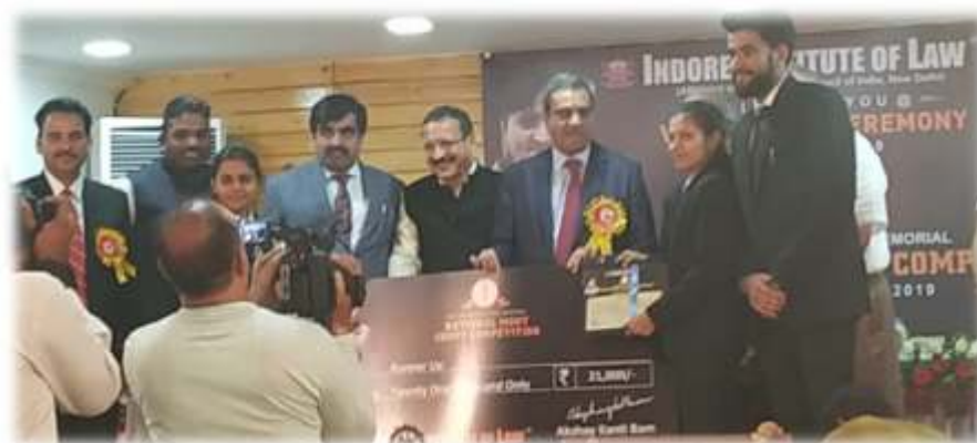
Runner Up Team from the "Nirmala Devi Bam Moot Court Competition" organised by Indore Institute of Law, Indore.