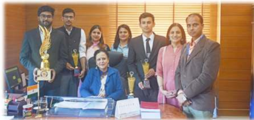
Members of the Winner Team from the Second National Moot Court Competition organised by Vasudeva College of Law, Nainital.